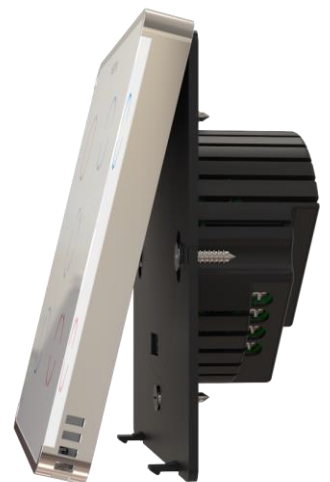
Figure 3: Install Touch Panel Unit

Note: Zero-Cross technology is unavailable if the device operates using DC voltage (24-48VDC).