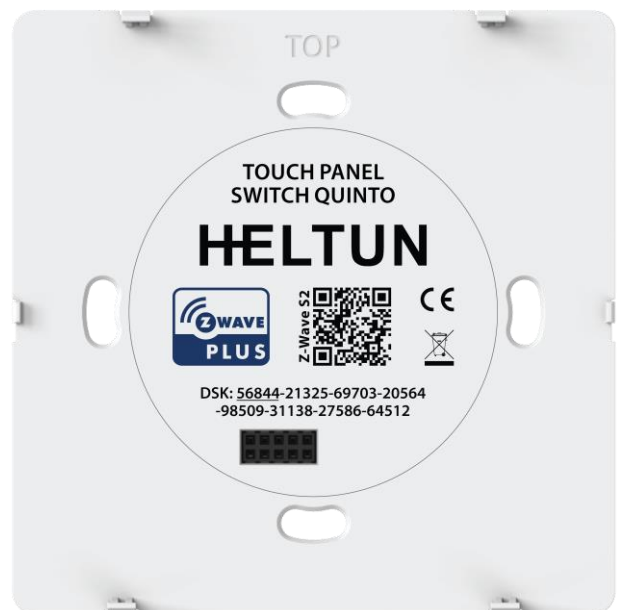
Figure 4: Security Code & QR Code

Association enables the HE-TPS05 to control up to 20 other Z-Wave devices over the network. The HE-TPS05 has 11 Endpoints and 21 Association Groups. Each Association Group (except group 1) may include one other device from different brands and/or manufacturers.